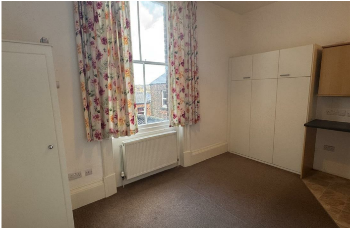
FIRST FLOOR 239 sq.ft. (22.2 sq.m.) approx.

LIVING AREA 4.383 x 2.550 (14'4" x 8'4") KITCHEN AREA 2.549 x 2.430 (8'4" x 7'11") BATHROOM 1.399 x 2.200 (4'7" x 7'2")